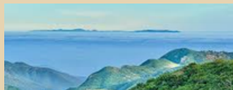
Santa Monica Mountains access