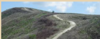
North Ranch trails