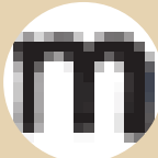
MATES Charter School