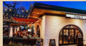
Finney's Craft House